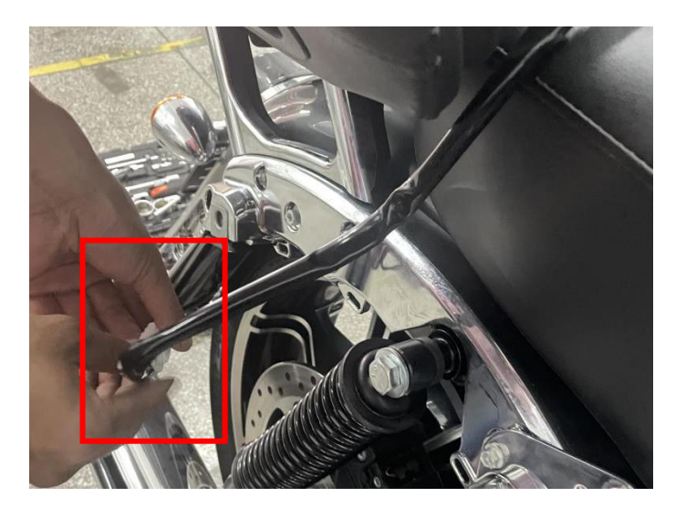
5. Installation finished.